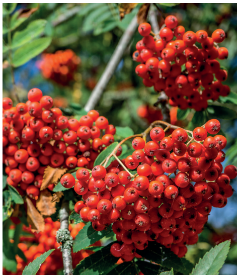
ROWAN BERRIES: BEN LEE/WTML

Sessile oak first ripe fruit and fly agaric first recorded were the least observed events with only 69 and 114 observations each.